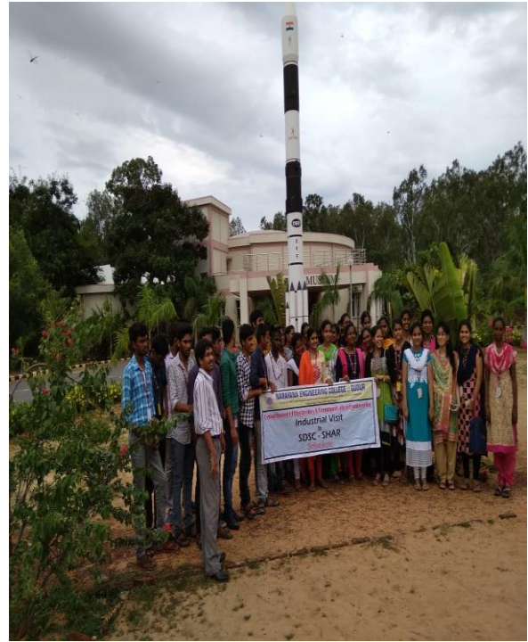
Industrial Visit to “SDSC SHAR”, Sriharikota by II ECE I&II students on 14.08.2018.