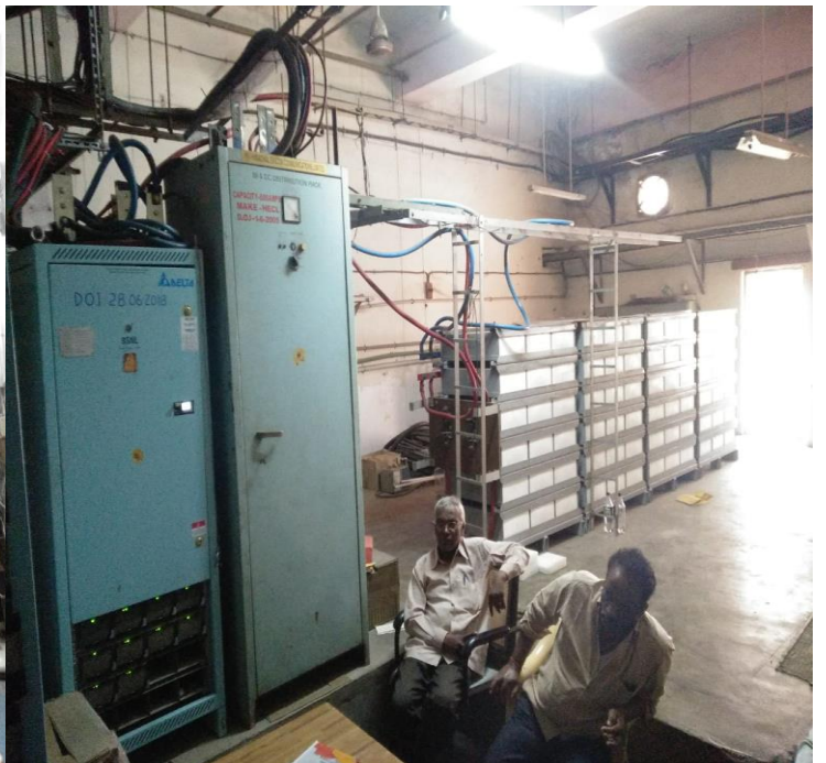
Industrial visit to “Bharat Sanchar Nigam Ltd (BSNL)”, Nellore, SPSR Nellore Dt by II ECE-I&II students on 16.02.2019.