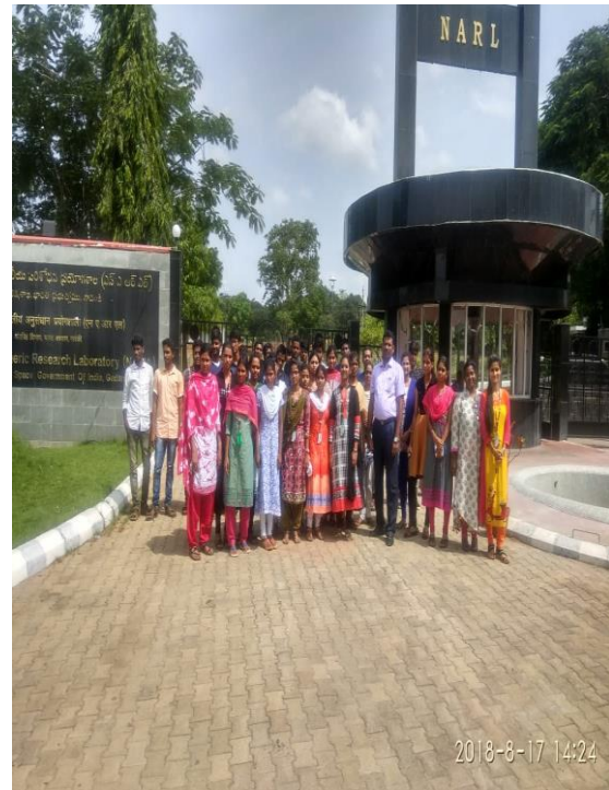
Industrial visit to “National Atmospheric Laboratory (NARL)”, Gadanki, Chittoor Dt by III ECE-I students on 17.08.2018.