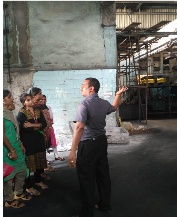
Industrial Visit to “Nippo Batteries”, Tada by III ECE-II students on 28.07.2018.